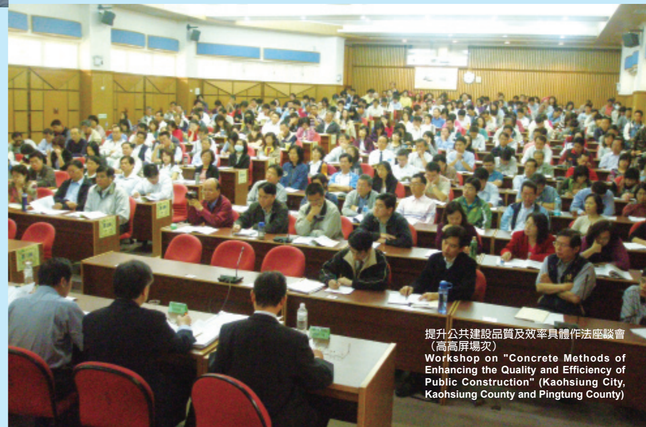
提升公共建設品質及效率具體作法座談會 （高屏場次） Workshop on "Concrete Methods of Enhancing the Quality and Efficiency of Public Construction" (Kaohsiung City, Kaohsiung County and Pingtung County)