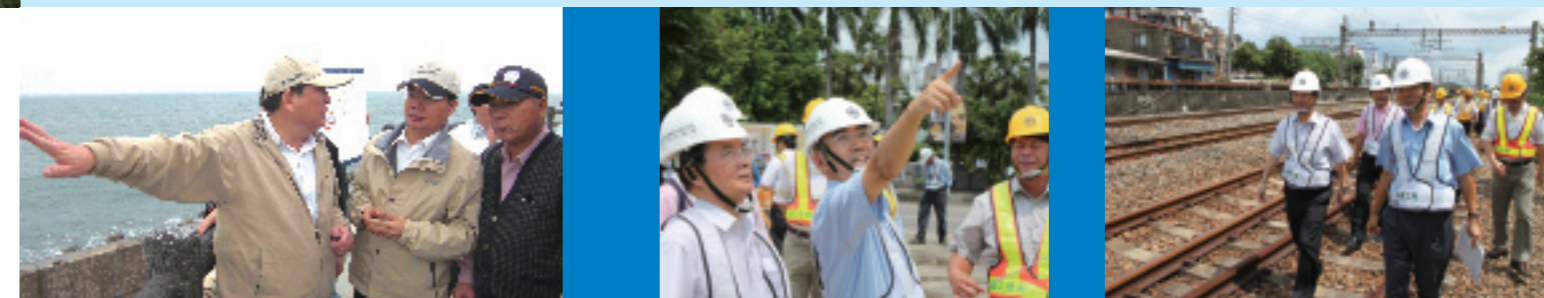
工程會首長走入基層傾聽民意 The PCC Minister visits the locals to listen to the public opinions