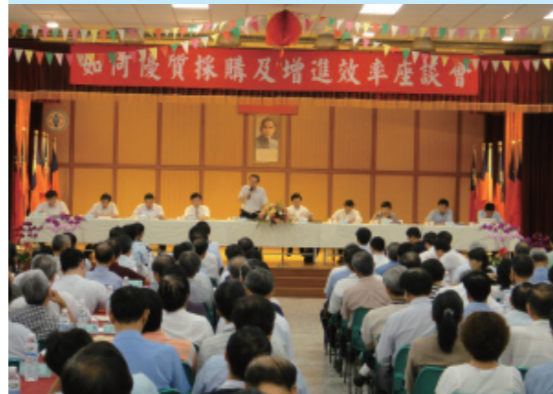
如何優質採購及增進效率座談會（高雄場） Workshop on How to Achieve High-quality Procurement and Improve Efficiency (Kaohsiung city)