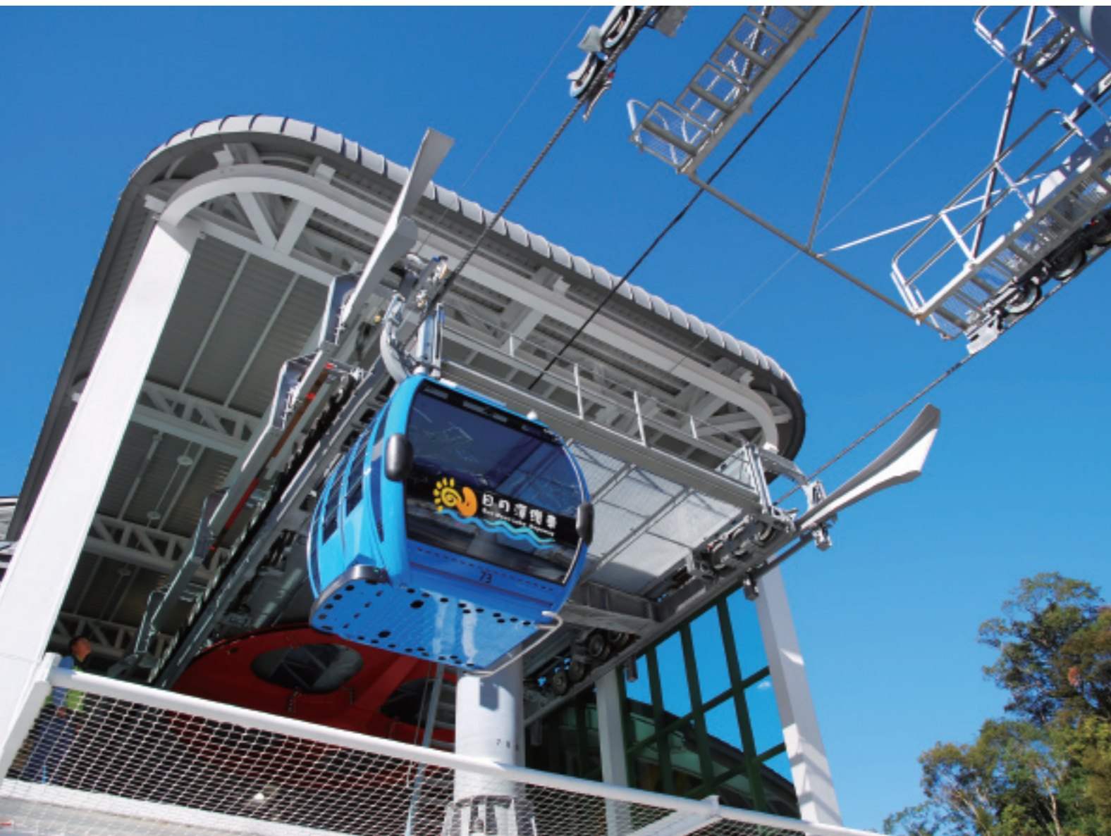
促參攝影比賽入選-日月潭纜車 PPIP Photo Contest Selection- the Sun Moon Lake Ropeway