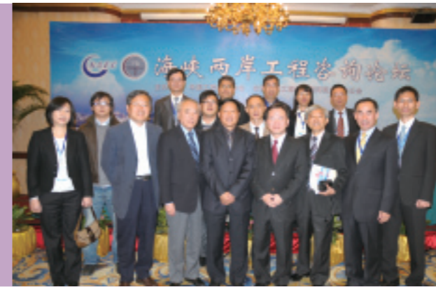
第二屆海峽兩岸工程諮詢論壇代表合影 A group photo of the Second Cross-strait Engineering Consulting Forum

於99年10月30日至11月6日於大陸北京、天津和福建三地舉行，由「台北市工程技術顧問商業同業公會」與「中國工程諮詢協會」共同主辦。論壇主題為「加強交流合作，促進發展共贏」，包括北京五個專題演講、天津考察空客320生產線和濱海新區規劃，以及福建參加海西與平潭島發展規劃介紹會。期國內業者能透過本次論壇與大陸加強兩岸交流合作，分享大陸快速發展之新商機，朝國際化邁進。