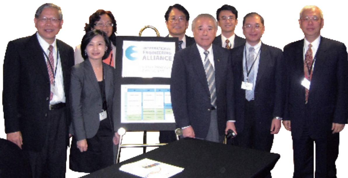
參加IEA期中會議 我國代表團合影 The Taiwan delegation to the IEA Interim Meeting

The second Cross-strait Engineering Consulting Forum, co-organized by the Taipei Federation of Engineering Consultants and the China National Association of Engineering Consultants, was held in Beijing, Tianjin, and Fujian on Oct. 30-Nov. 6, 2010. The forum, held under the theme of "Strengthening Interchange and Cooperation, Promoting Win-Win Development," included five speeches in Beijing, an inspection visit to the Airbus A320 production line and the New Coastal District Plan in Tianjin, and an introduction meeting for an economic zone on the western side of the Taiwan Straits and Pingtan Island development plan in Fujian. The aim of the forum was to boost cross-straits business interchange and cooperation between Taiwan and China, share in the new opportunities deriving from China's rapid development, and advance toward globalization.