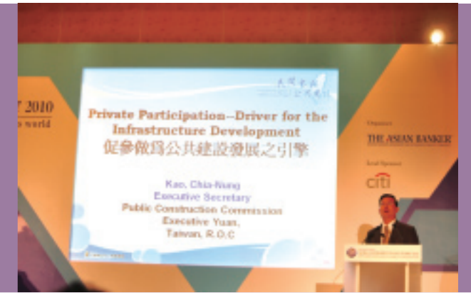
促參籌備處於2010全球政府財政峰會發表我國促參經驗 Presenting Taiwan PPP experience and opportunities at the 2010 Global Government seminar