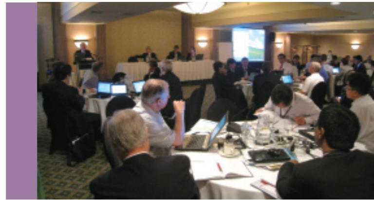
我國於IEA期中會議簡報增加認證水利技師 Taiwan briefs EMF representatives on adding hydraulic engineer certification

於99年6月21日至6月25日加拿大渥太華舉行，我國工程界代表團於會議中報告辦理「亞太工程師」及