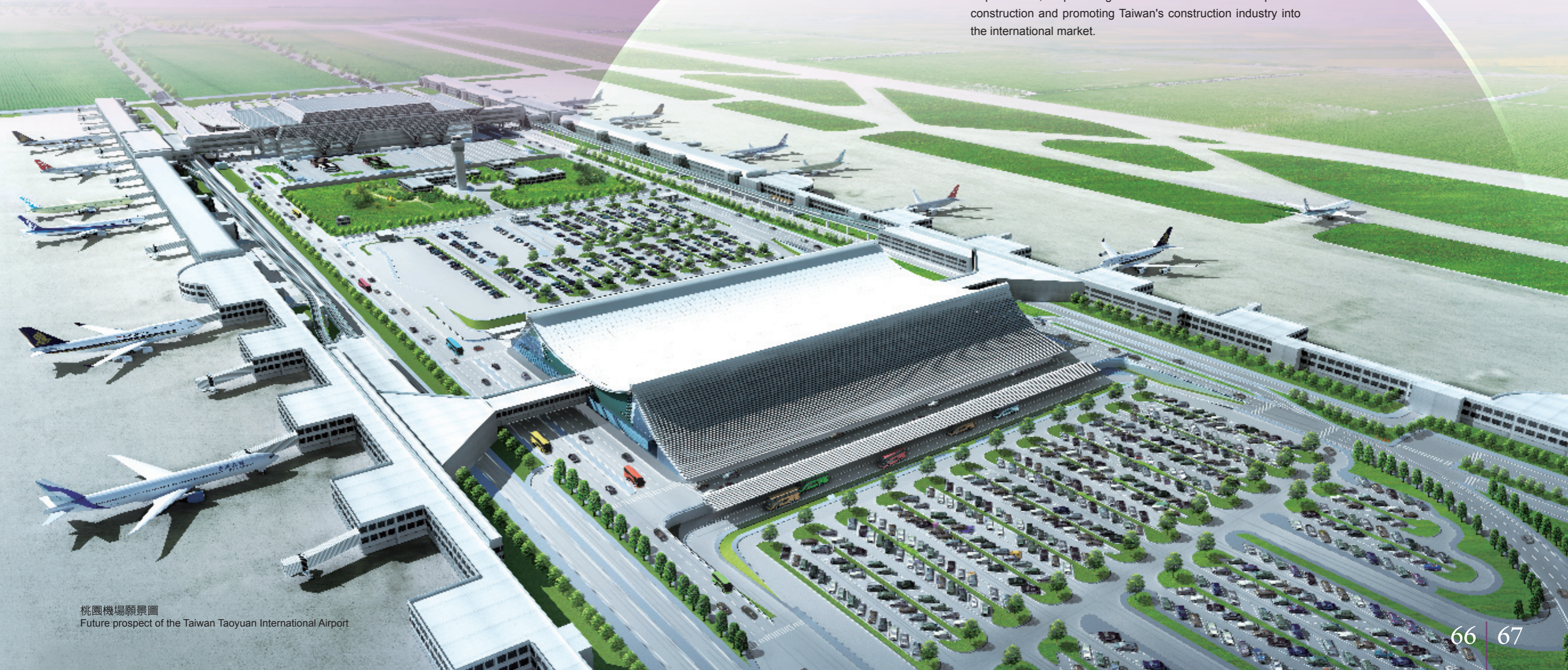
桃園機場願景圖 Future prospect of the Taiwan Taoyuan International Airport

The PCC strives to enhance the quality of public construction by participating in all kinds of international activities, setting up communication platforms, marketing business opportunities, and through the exchange of experience, expanding the vistas of domestic public construction and promoting Taiwan's construction industry into the international market.